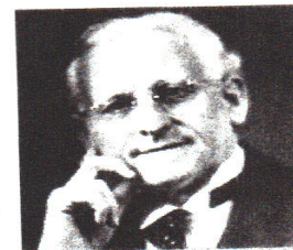
Reverend George Bennard